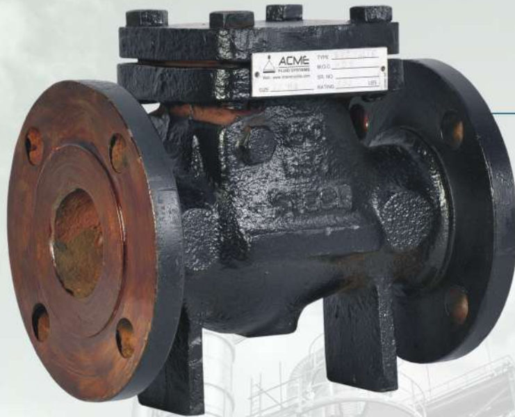
Swing Check Valves