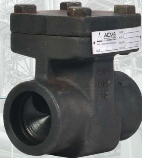
Lift Check Valves