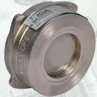
Wafer Check Valves